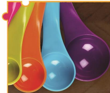
Figure 1-1. Cup- & Ounce-Equivalents

Within a food group, foods can come in many forms and are not created equal in terms of what counts as a cup or an ounce. Some foods are more concentrated, and some are more airy or contain more water. Cup- and ounce-equivalents identify the amounts of foods from each food group with similar nutritional content. In addition, portion sizes do not always align with one cup-equivalent or one ounce-equivalent. See examples below for variability.